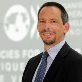
Piet Battiau OECD

Piet Battiau is responsible for the OECD's work on indirect taxes, including the International VAT/GST Guidelines; the OECD recommendations for addressing the VAT challenges of digital trade; helping tax authorities to enforce VAT compliance in digital trade; the OECD's VAT capacity building work incl. through the development of Regional VAT Digital Toolkits; the Consumption Tax Trends publication; and the OECD Global Forum on VAT. Current priorities include the development of guiding principles for the design and implementation of "digital continuous transactional reporting" (DCTR) regimes for VAT and international policy dialogue on the VAT treatment of crypto-assets. Piet joined the OECD in 2011. He began his career as a tax inspector for the Belgian Ministry of Finance in the early 1990's before moving on to an international financial institution in 1995, where he became Head of International Taxation and subsequently Head of Public Policy. He was also Chairman of the Fiscal Committee of the European Banking Federation. He studied Law in Brussels and Ghent and holds a Law degree and a degree in Tax Science.